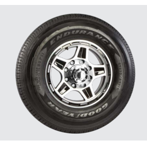
GOODYEAR BEAST TIRES Made in the U.S.A. and featuring the patented Durawall® technology.