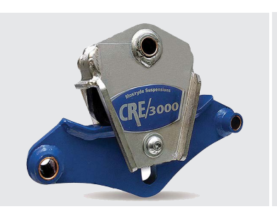
MORRYDE RUBBERIZED SUSPENSION SYSTEM Better absorbs and isolates