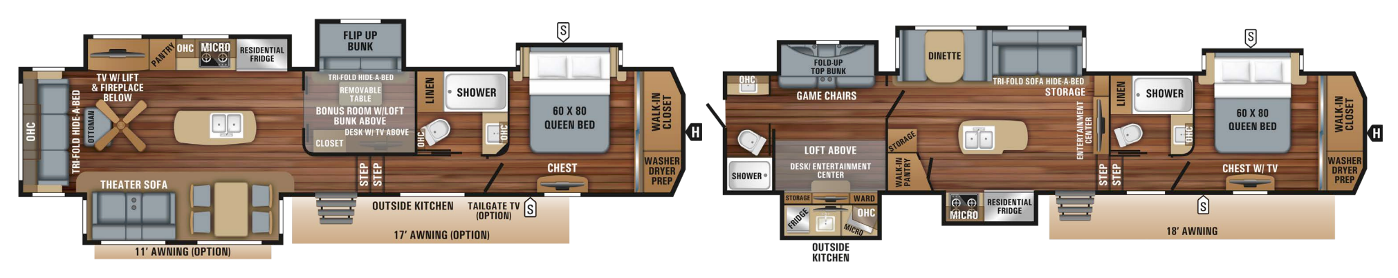
377RLBH OPTIONS: A, C, D, F