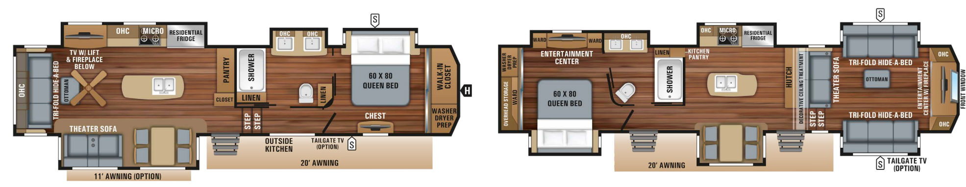
381DLOS OPTIONS: A, C, D, F