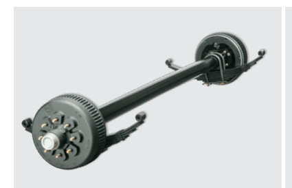
DEXTER AXLES WITH NEV-R-ADJUST BRAKES The Benchmark of the

The 5 Star Handling Package is a Jayco exclusive, a powerful blend of high-end components that make pulling a luxury fifth wheel a breeze.